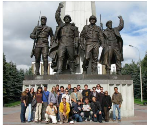
Articulation and Assessment in Global Learning