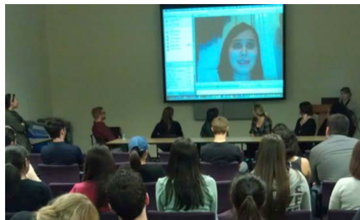
Technologies for Global Learning