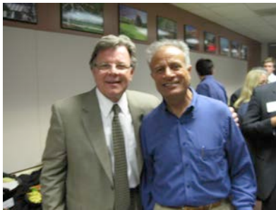
The Activities of The Global Studies Institute Are Made Possible by the Envidable CSULB Culture of Close Relations Between Faculty and Administration