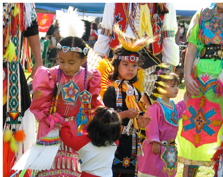
Young Dancers at the 36th CSULB Pow Wow