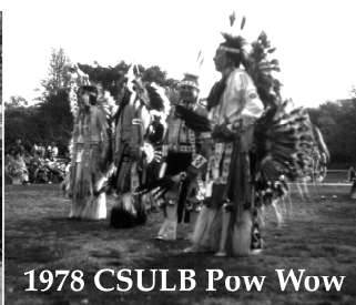
18 th Annual Pow Wow