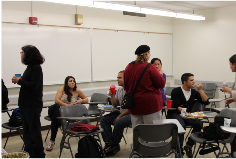
On February 18 th dozens of students ate delicious food and networked with their fellow Anthropology peers and teachers at an ASA mixer.

Congratulations to the incoming officers for the 2012-2013 school year! If you are interested in becoming an officer next semester be sure to email anthrostudentassoc@gmail.com to get on the ASA mailing list and find them on Facebook!