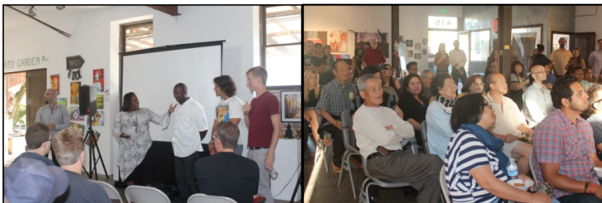
Students participating in a Q & A