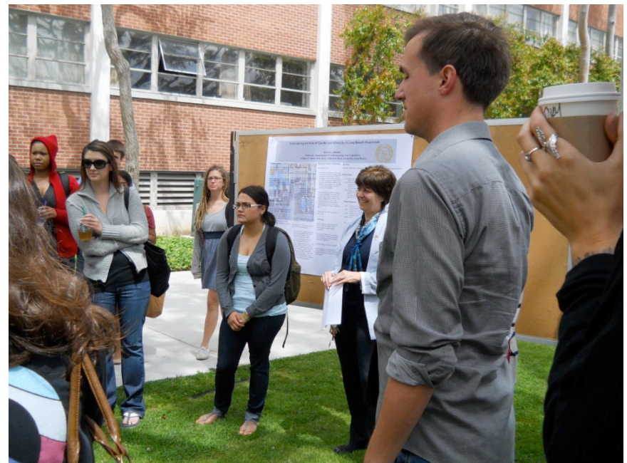
Students and faculty members listened to presentations throughout the day