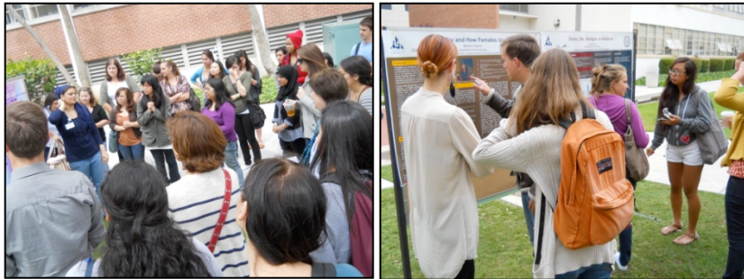
Students presenting their research information