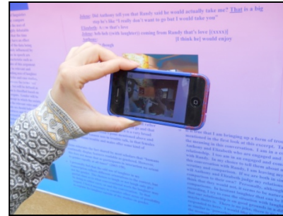
Video playing with the Aurasma Lite App on i-Phone