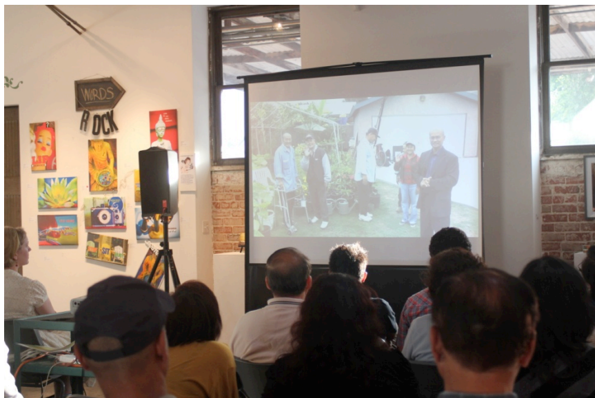
Students and faculty, and community members watching one of student films