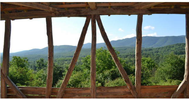
View from the 300 sq. meter barn at the Stone & Compass Center

rob@stoneandcompass.com www.stoneandcompass.com