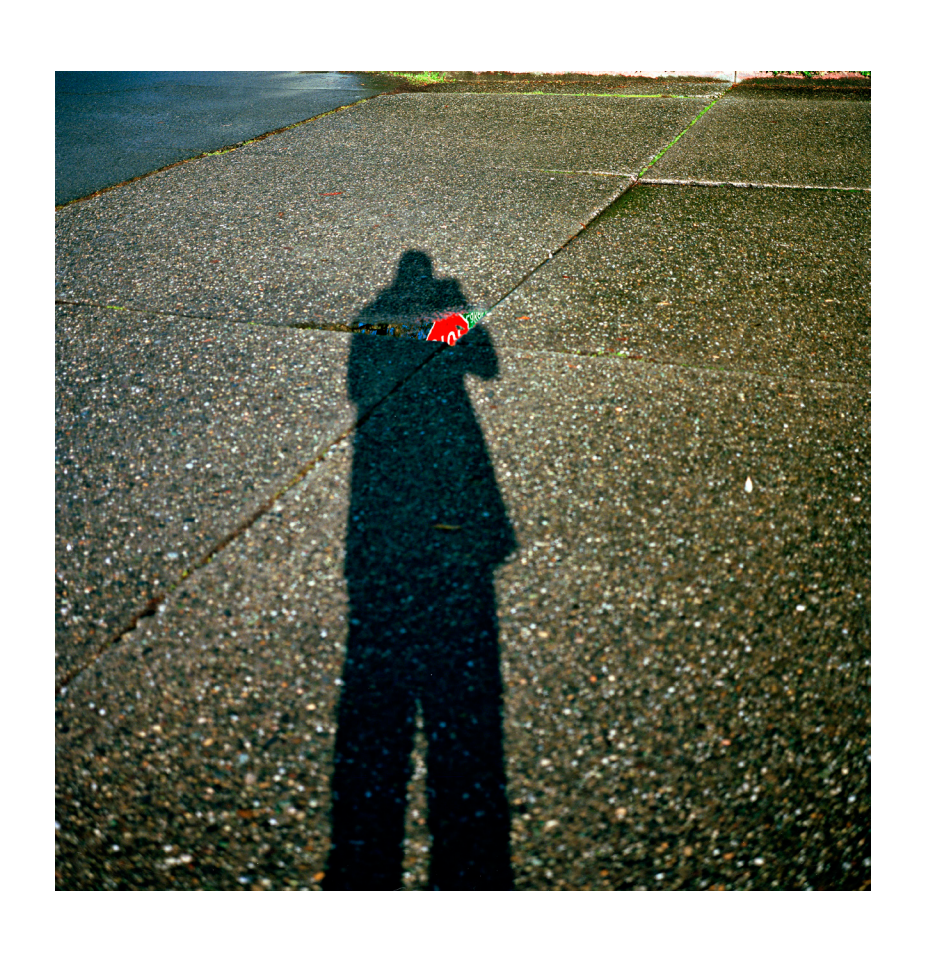
REFLECTION OF A MAN