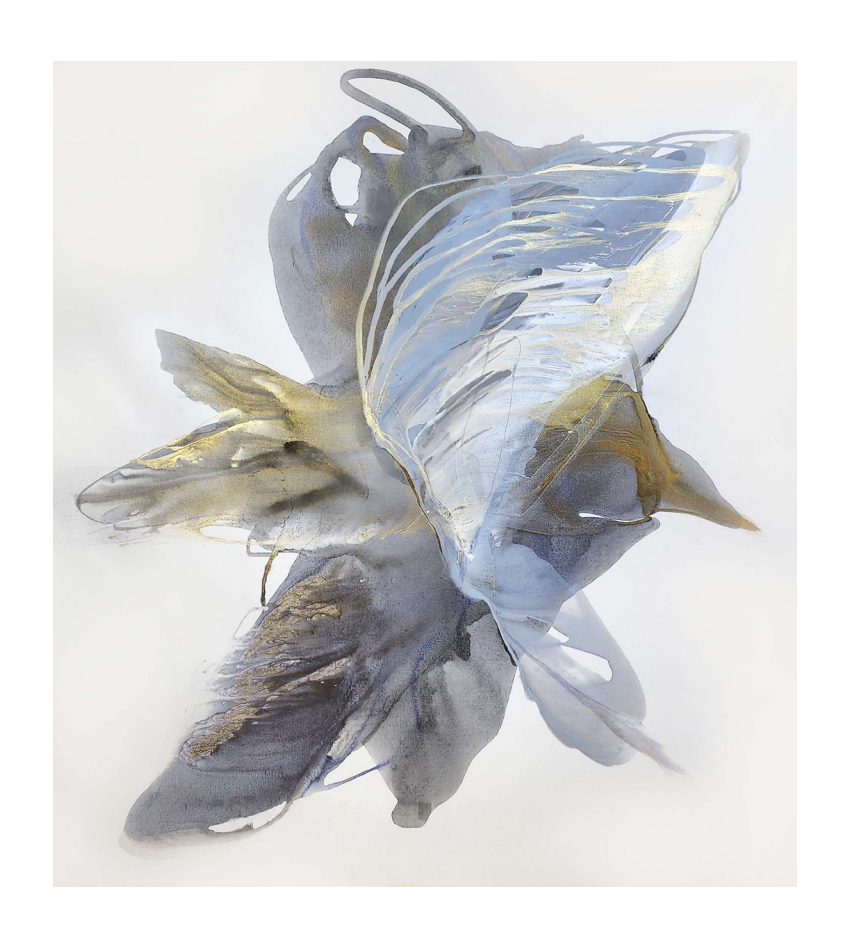
INTO THE LIGHT