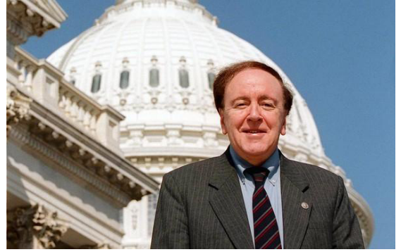
Dr. Steve Horn