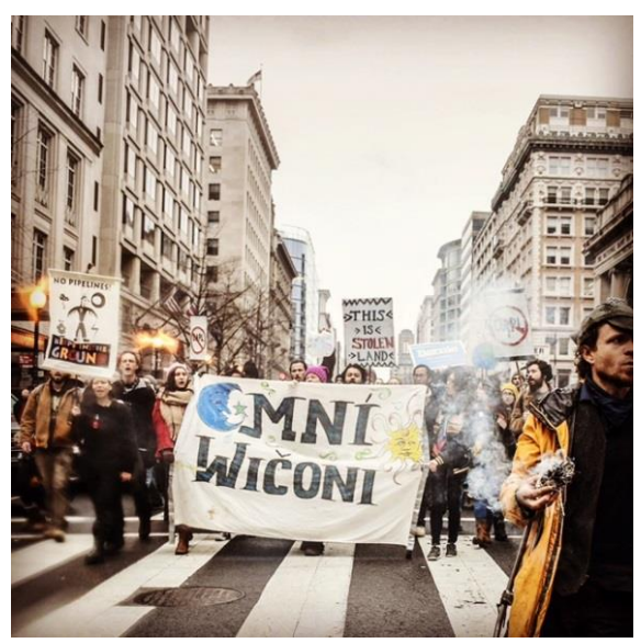
Water Protectors participate in peaceful action on Inauguration Day in Washington D.C.

"In late November 2016, Kylie Shahar and I had the incredible opportunity to stand in solidarity with the Water Protectors at Standing Rock in North Dakota. We camped in Oceti Sakowin protest camp for 6 days, and along with attending camp meetings and helping organize donations, we also had the opportunity to participate in three major peaceful actions against the Dakota Access Pipeline (DAPL). The indigenous-led act of peaceful resistance against the pipeline was a truly revolutionary act, with the goal of preserving the land, the culture and the dignity of the indigenous peoples of the land. It was a lifechanging experience to have been a part of such an important and enlightening act of collective action. After our relatively short time at camp, we returned to Long Beach to finish out the fall semester, but were determined to return to camp as soon as we were able.