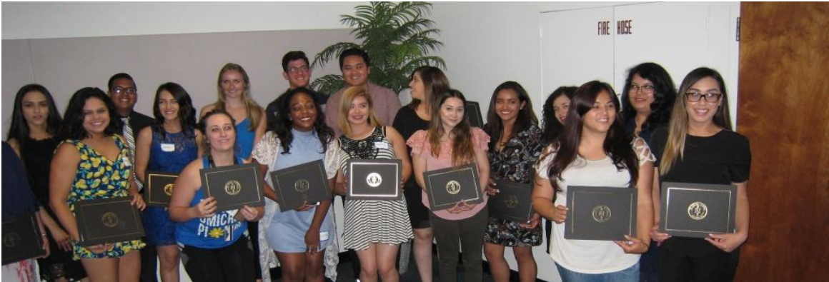
2017 Pi Sigma Alpha initiates receive their membership certificates