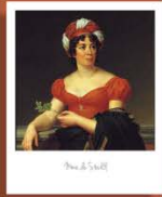
Mme de Staël

"The Nineteenth-Century in 2019. Mapping Women's Writing in the Long Nineteenth Century"