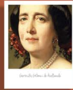
Gertrudis Gómez de Avellaneda