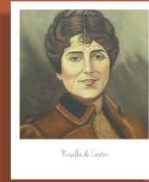
Rosalía de Castro